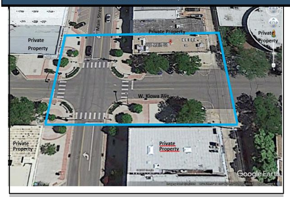
MCC's Clery Reportable Boundary *Surrounding properties are all privately owned.